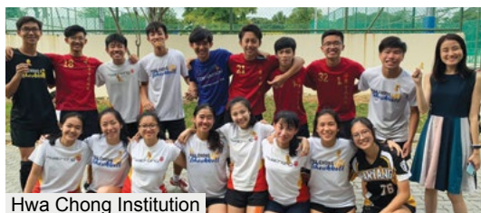
Hwa Chong Institution