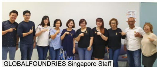
GLOBALFOUNDRIES Singapore Staff

Many netizens also stepped forward to enquire how they could make a donation, volunteer or invite CCF to conduct awareness talks at their premises. CCF would like to express our sincere appreciation to everyone who joined us for #myGOLDpledge 2020 and for making it a successful run once again.