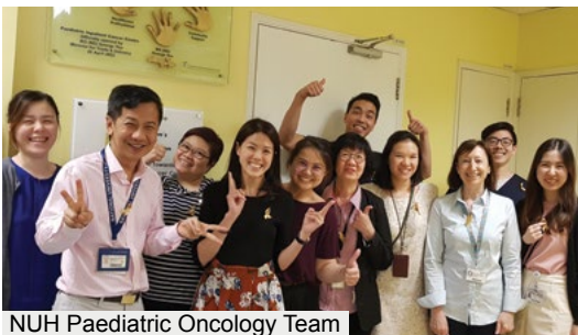
NUH Paediatric Oncology Team