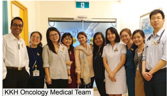
KKH Oncology Medical Team

The Gold Ribbon symbol is used to express support for the effort against childhood cancer. Gold goes through a process by fire to become stronger and tougher. Children with childhood cancer undergo a similar experience. They often develop strength and resilience from facing all the difficult and painful challenges of childhood cancer.