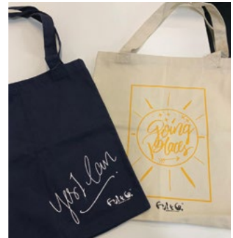
Contributor: Fish & Co. Restaurants Pte Ltd.

For the first time, Fish & Co organised a fundraiser to support CCF in hopes to improve the quality of life of children and families affected by cancer. We placed our two unique tote bags, "Yes I Can" and "Going Places", at our 11 storefronts island wide and ensured that our customers were aware of how their bag purchase would better the lives of CCF beneficiaries. Through sales of our two unique tote bags, "Yes I Can" and "Going Places", we managed to raise a total of $1,712.20 for CCF. We hope that our actions would inspire more organisations to organise similar fundraising events as well to benefit the community.