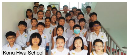
Kong Hwa School

Reach out to us at comms@ccf.org.sg if you would like to invite us to your organisation, school or events to share more about childhood cancer.