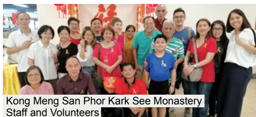
Kong Meng San Phor Kark See Monastery Staff and Volunteers