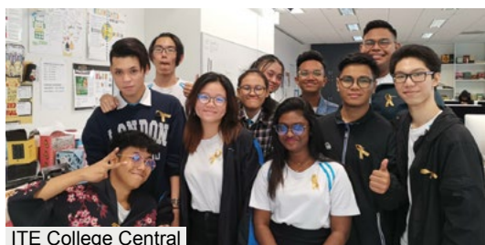
ITE College Central