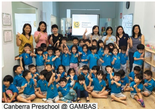
Canberra Preschool @ GAMBAS