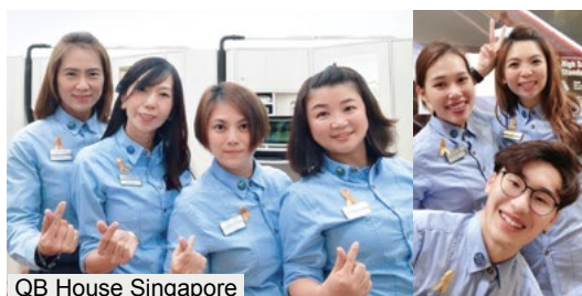
QB House Singapore